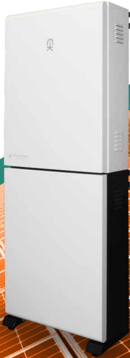
ENIK Energy Wall