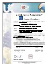
IEC Certificate of Compliance