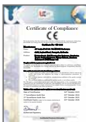
CE Certificate of Compliance