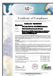
RoHS Certificate of Compliance