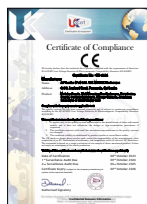
CE Certificate of Compliance