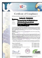
RoHS Certificate of Compliance