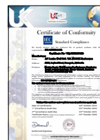
IEC Certificate of Compliance