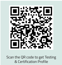
Scan the QR code to get Testing & Certification Profile